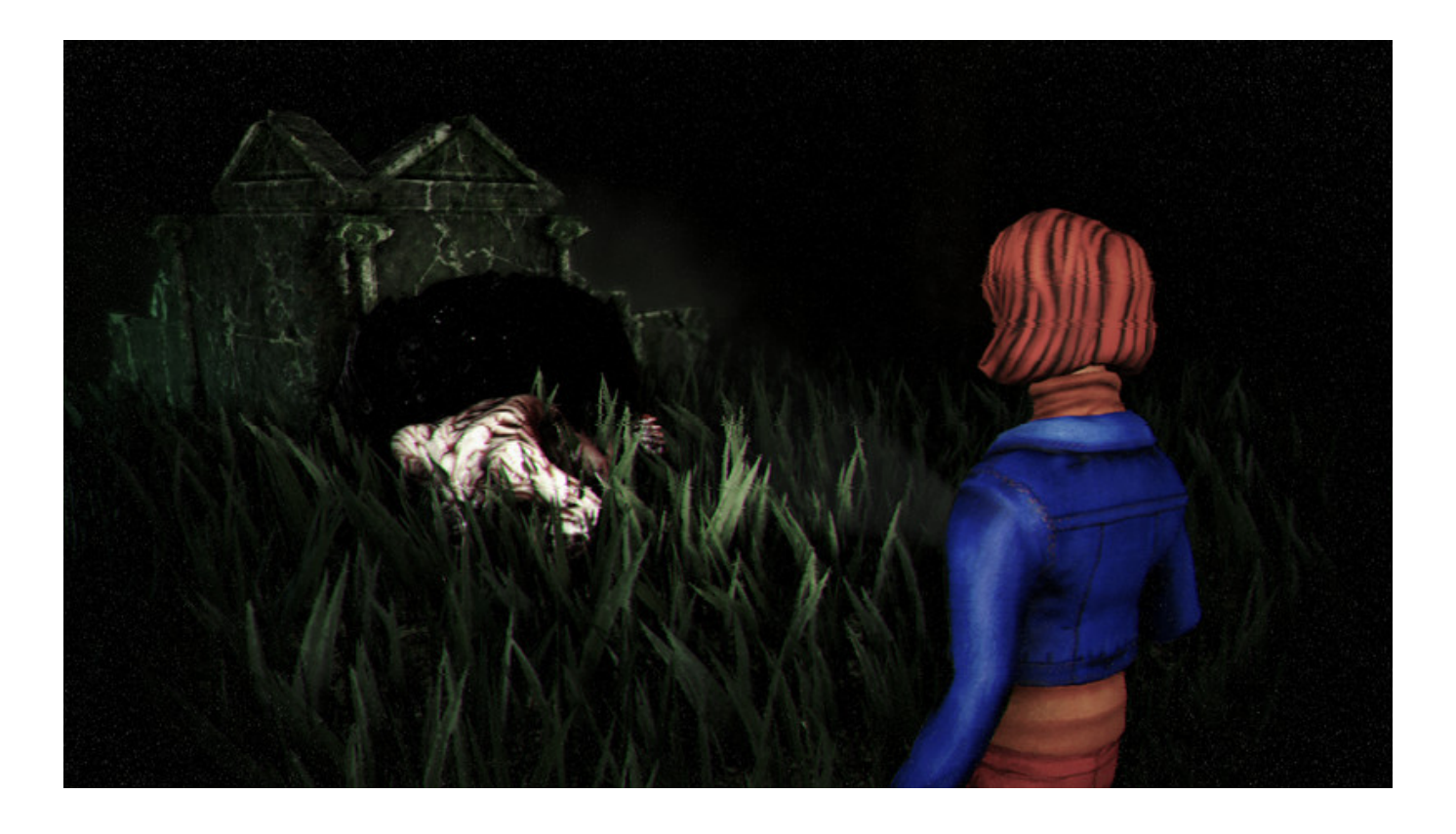
White Noise 2 Download Windows 8

Download ->>->> <a href="http://bit.lv/2NCJc43">http://bit.lv/2NCJc43</a>